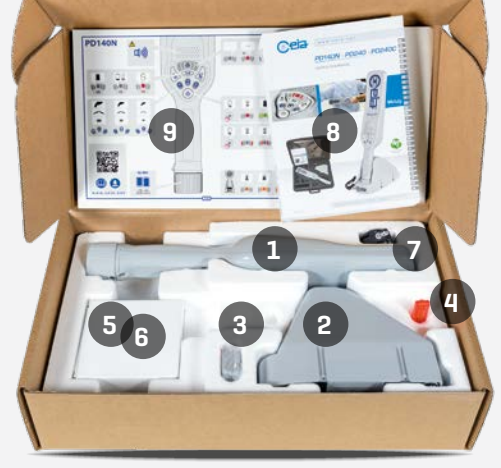
PD140N (# PD140N-SET)