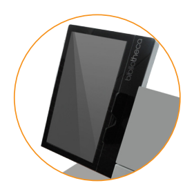
22" portrait orientation displays over 20 items on screen

These very attractive benefits can be seen in the standard model of every smartserve™ 1000.