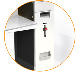
accept fees and return change with coin & note