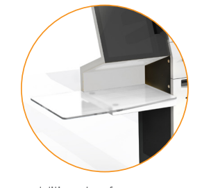
additional surface area holds bags and extra books