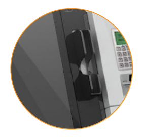
secured media items can be unlocked at the kiosk