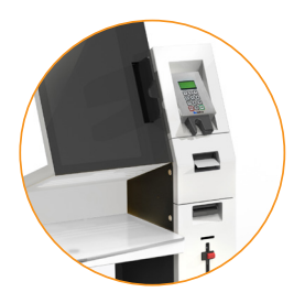
increase library collections with chip & pin payments