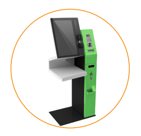
over 200 custom colours to match any library decor