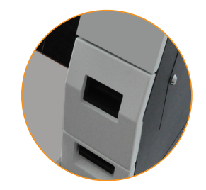
built-in receipt printer provides a complete account statement