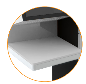
dedicated RFID zone reads up to 15 items at a time