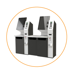
integrated bins allow patrons to return items at the kiosk