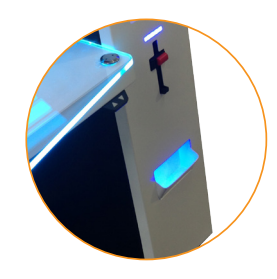
light based indicators guide the patron through the process