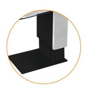
height adjustable control to suit individual users

Create your perfect kiosk by choosing between the following add-on options: